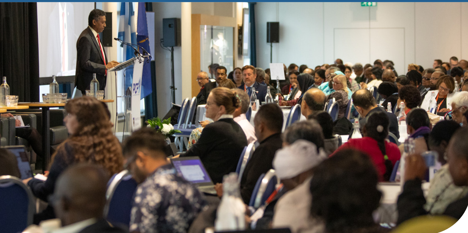
His Excellency Danny Faure, President of the Republic of Seychelles, at PCF9.