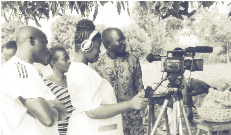
STAFF OF THE FREETOWN TEACHERS COLLEGE SHOOT VIDEO DURING A MULTIMEDIA TECHNOLOGY TRAINING SESSION