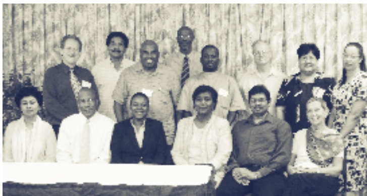
PARTICIPANTS AT THE AUTHORS MEETING FOR FOREIGN TERTIARY EDUCATION PROVIDERS IN THE ANGLOPHONE CARIBBEAN IN TRINIDAD & TOBAGO IN OCTOBER

In addition to reviewing the situation in their own countries, participants identified opportunities for collaboration across the region. Already there has been sharing of course materials and broadcast facilities among organisations in South Asia. COL is encouraging continuing co-operation and sharing of knowledge through a Literacy and Livelihoods association that is being formed by meeting participants. Similar regional meetings will take place in the Pacific and Africa in 2006.