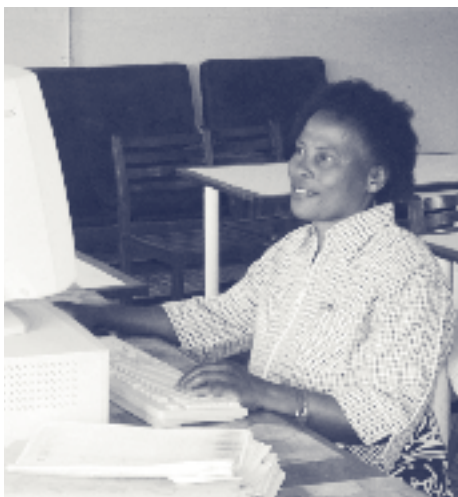
A TEACHER WORKS AT A COMMUNITY TELE-LEARNING CENTRE SUPPORTED BY COL IN ZAMBIA

Of the 17 countries participating in the first cycle of the Initiative, five are Commonwealth countries: Ghana, Nigeria, Sierra Leone, Tanzania and Zambia. COL has been active in all of them, providing support for the