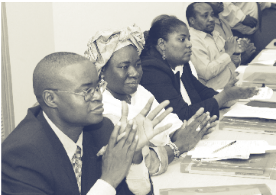
TEACHER EDUCATION ADMINISTRATORS AT THE JOINT MANAGEMENT DEVELOPMENT INSTITUTE IN SINGAPORE

11-14 DECEMBER 2006 CAPE TOWN, SOUTH AFRICA. THEME: ACCESS TO QUALITY EDUCATION: FOR THE GOOD OF ALL