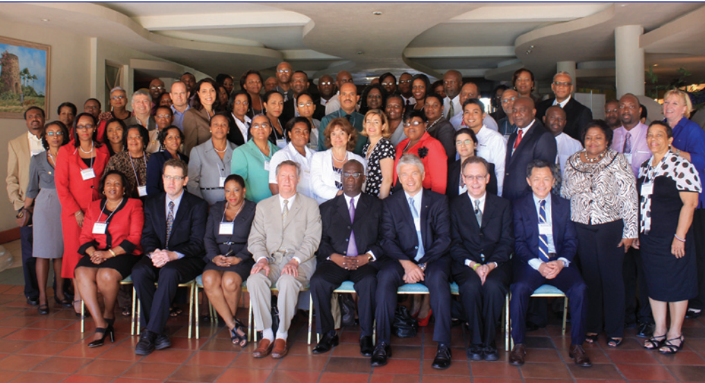
THE REGIONAL POLICY FORUM IN BARBADOS IN JANUARY BROUGHT TOGETHER EDUCATORS FROM ACROSS THE CARIBBEAN

COL and UNESCO have embarked on a major initiative to encourage more governments to adopt policies that encourage open educational resources (OER). “Fostering Governmental Support for OER Internationally” seeks to increase understanding by governments of the significance of OER and gather support for the principle that the products of publicly funded work should carry open licenses.