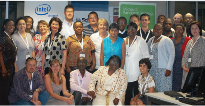
LEADERS FROM SOUTHERN AFRICAN TEACHER EDUCATION INSTITUTIONS ATTENDED THE WORKSHOP AT THE SCHOOL OF TECHNOLOGY AND INNOVATION CENTRE IN NEWTOWN JOHANNESBURG

“Teaching with Technology for Institutional Leaders” is a new COL initiative that helps teacher education institutions to understand and apply the compelling advantages of using technology in the classroom and throughout their organisation. The first activity was a two-day workshop for teacher education institutional leaders on the use of information