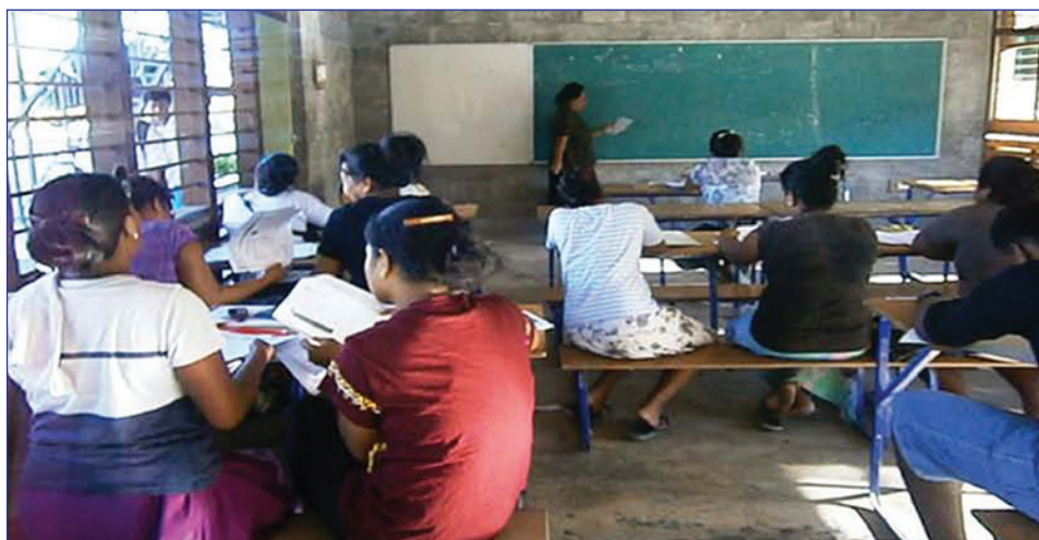
THE NEW OPEN SCHOOL IN KIRIBATI

COL's Pacific Island Open Schooling Project is supporting the expansion of open schooling in the Pacific region and currently includes the establishment of three new open schools. All three open schools – in Kiribati, Solomon Islands and Tonga – are focusing on providing “second-chance” education for school dropouts and unemployed youth. Local University of the South Pacific (USP) campuses are leading implementation of the new open schools.