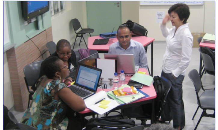
THE 12-DAY VUSSC WORKSHOP WAS HELD AT THE NATIONAL INSTITUTE OF EDUCATION (NIE) INTERNATIONAL IN SINGAPORE FROM 17 NOVEMBER TO 2 DECEMBER 2011

Improving educational leadership in higher education institutions in small states of the Commonwealth was the focus of a workshop hosted by COL and the Singapore Ministry of Foreign Affairs. The workshop is an initiative of the Virtual University for Small States of the Commonwealth (VUSSC) to build capacity among tertiary education providers in its 33 member states. The Singapore Ministry of Foreign Affairs has hosted some ten VUSSC-related activities since 2005.