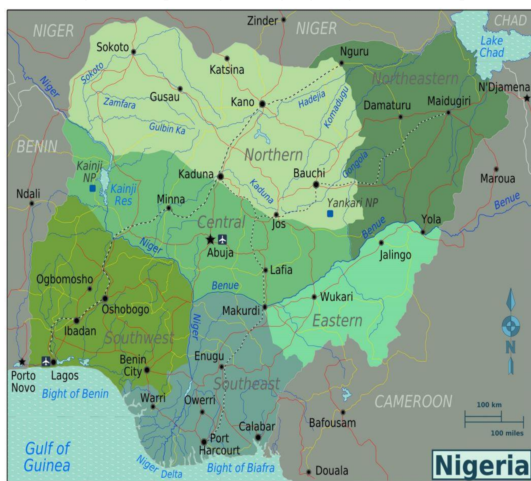
Figure 1. Map of Nigeria - highlighting the Northern part

This study explores how integrating local dialects into blended vocational training can bridge skill gaps, enhance engagement, and boost employability among youth in Northern Nigeria.