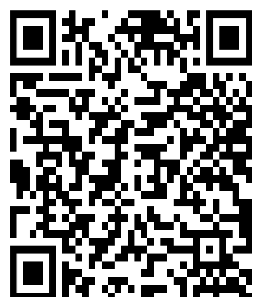
Figure 3. Barcode (Scan for References)