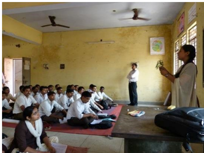
Figure 1: A micro teach at Harpur DIET

Trainee teachers at Harpur DIET (Figure 1) also pointed to Wikipedia's value for helping increase school attendance, one explaining that 'if we can use Wikipedia to make our teaching more interesting we are more likely to keep the children in school'.