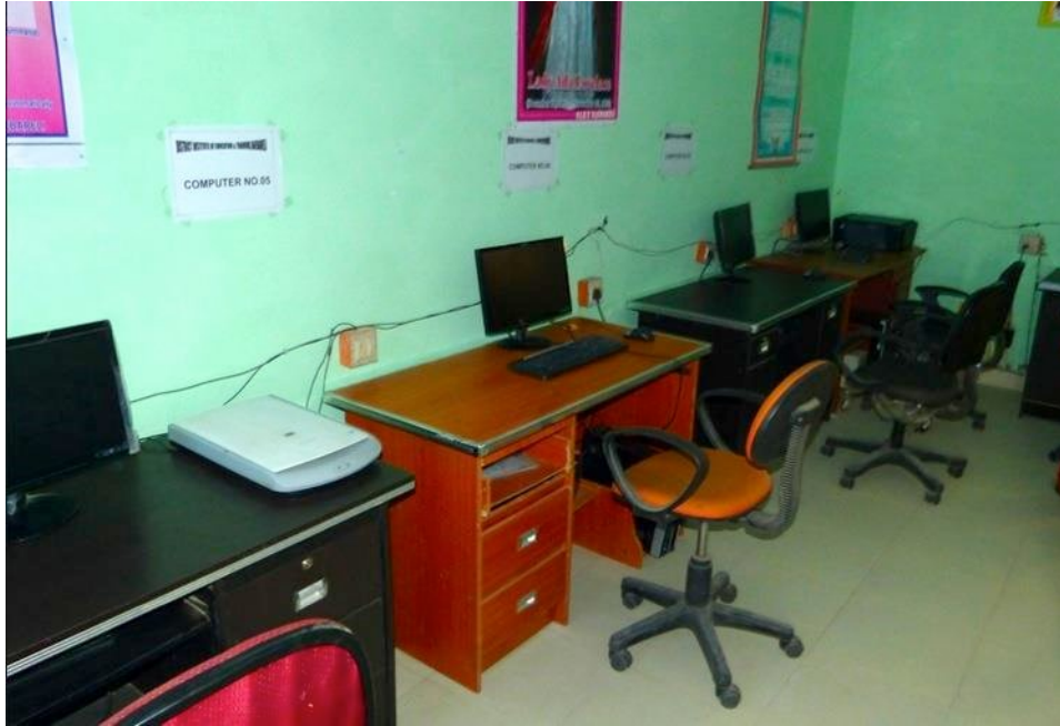
Figure 2: the Raebareli DIET Computing Lab

Lucknow DIET is the most well-equipped of the three DIETs visited, with Internet-connected PCs, data projectors in every classroom. However, even here the potential for OER use is not straightforward as the teacher-educators still have limited ICT skills. A teacher-educator at Lucknow DIET revealed that she finds it difficult to teach trainee teachers who are more ICT-skilled than she is, commenting that ‘they expect me to be as good as them because I’m the lecturer but I have nothing new I can show them’.