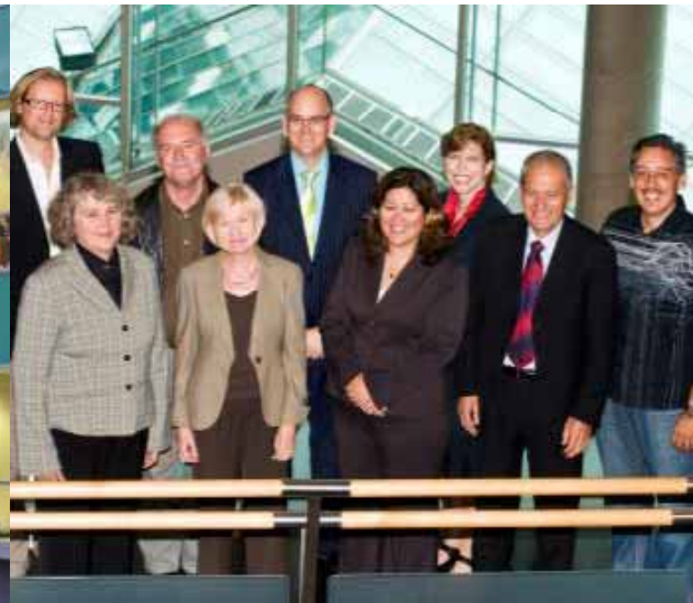
Images left to right: Teaching food technology in Singapore; the Hopkirk building; members of the School of Public Health