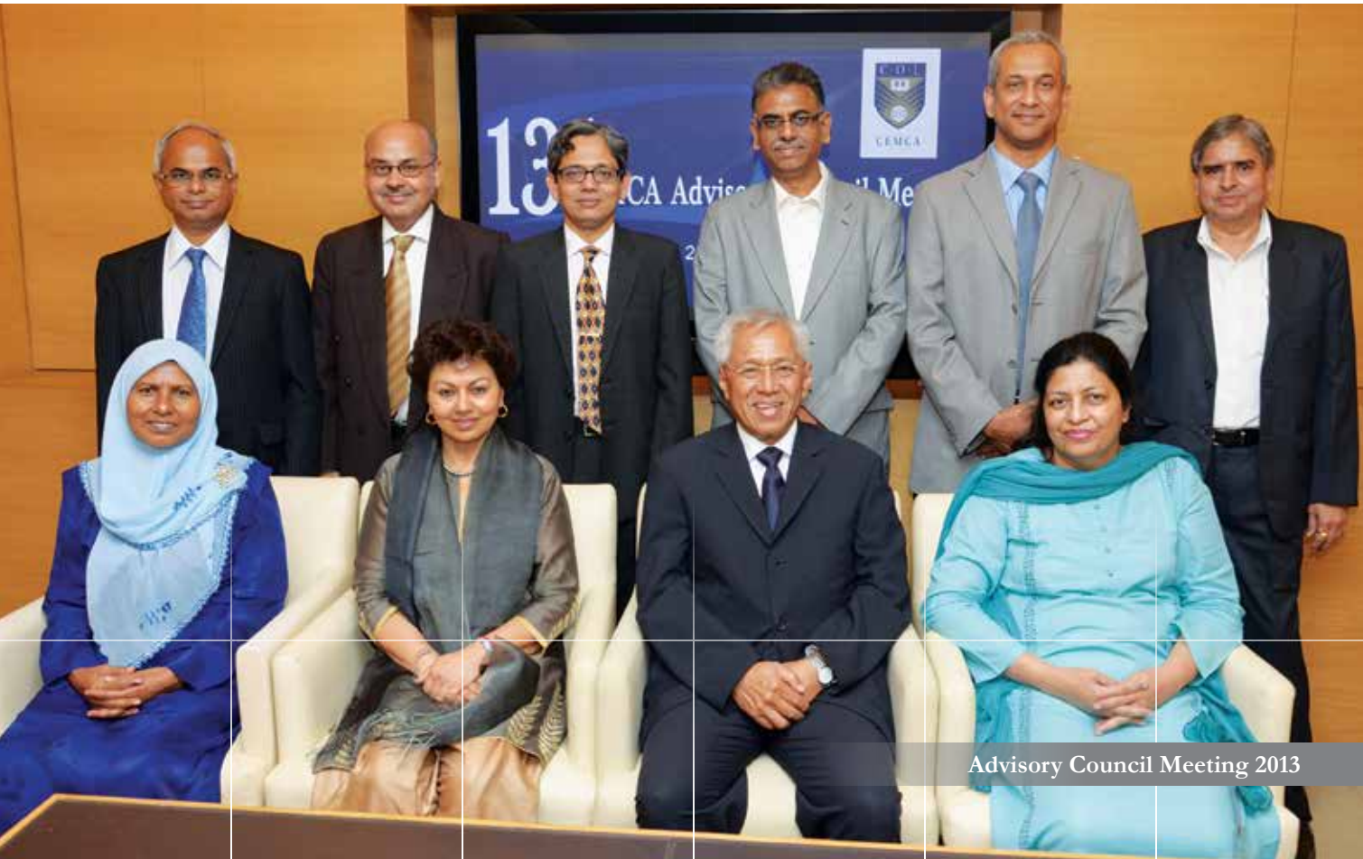
Advisory Council Meeting 2013