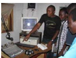
Dzimwe Community Radio Station staff receive new phone-in equipment and training