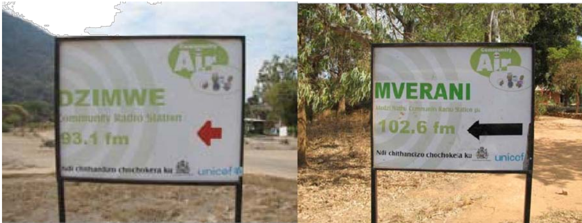
Signs for Dzimwe and Mudzi Wathu Community Radio Stations