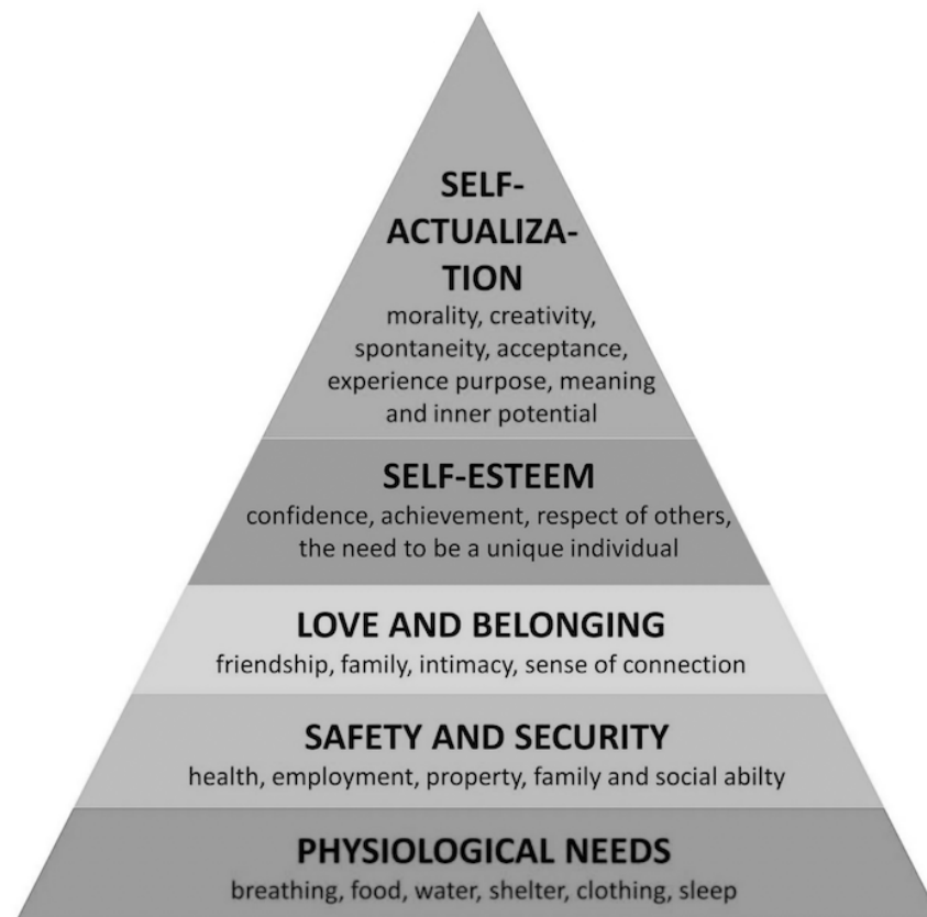
Figure 2: Maslow's hierarchy of needs

Figure 2 accentuates that the priority and largest needs for refugees are physiological and safety needs. This graphic also highlights that despite our typical view of these being sequential they are often thrown into disarray for refugees. At the same time, it is equally important to recognise that self-esteem and acceptance are powerful factors for social assimilation and integration by the host group. In essence, the first four levels are interconnected and reinforce refugee resilience that collectively empowers individual capacity and the potential of digital technologies to support refugees.