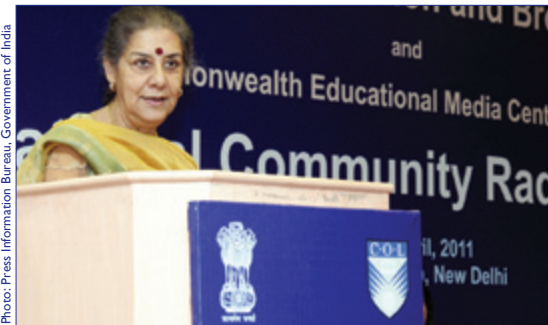
THE HONOURABLE MINISTER FOR INFORMATION AND BROADCASTING, AMBIKA SONI, AT THE COMMUNITY RADIO SAMMELAN IN APRIL

These latest activities are part of CEMCA's efforts to support the expansion of