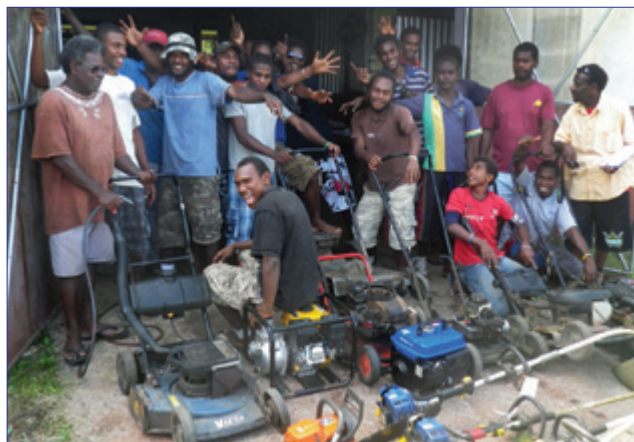
WORKSHOP PARTICIPANTS IN VANUATU DISPLAY REPAIRED SMALL ENGINES

Five training courses developed in partnership with COL have been accredited by the Vanuatu National Training Council. The COL courses in Small Business, Small Engine Maintenance, Tourism as a Business, Working with Timber and Working with Concrete are accredited at Level 2 on the National TVET