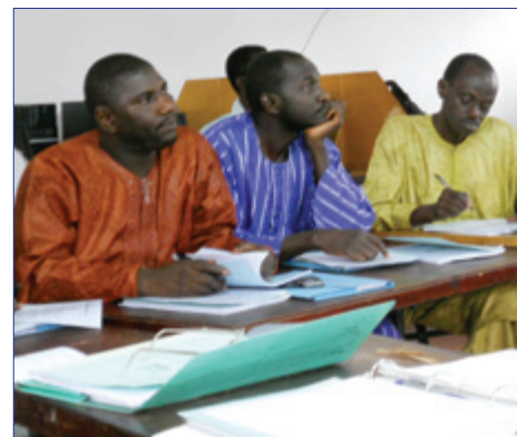
PARTICIPANTS AT THE INSTRUCTIONAL DESIGN FOR OPEN & DISTANCE LEARNING WORKSHOP IN BANJUL, THE GAMBIA IN JANUARY 2011

The objectives of the workshop were to enhance the participants’ understanding of the use of ODL to train and upgrade teachers, and to disseminate basic skills in instructional design. Learner support and areas requiring COL’s support, including course development, management of ODL and ODL tutoring, were also explored.