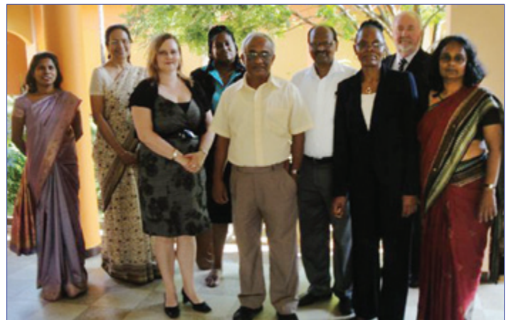
AN INTERNATIONAL TEAM MADE A VERIFICATION VISIT TO SUPPORT COL RIM IMPLEMENTATION AT THE OPEN UNIVERSITY OF SRI LANKA IN DECEMBER 2010

The COL RIM package, consisting of a conceptual framework and handbook, is freely available from COL. For