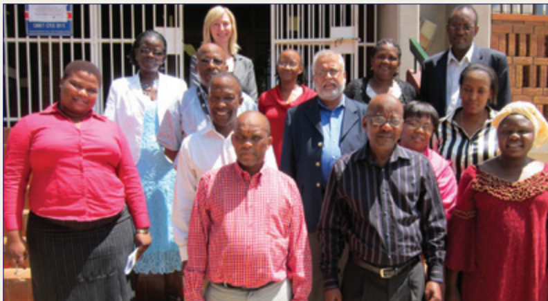
EDUCATORS FROM THE UNIVERSITY OF LIMPOPO AT A CURRICULUM WRITING WORKSHOP HOSTED BY COL