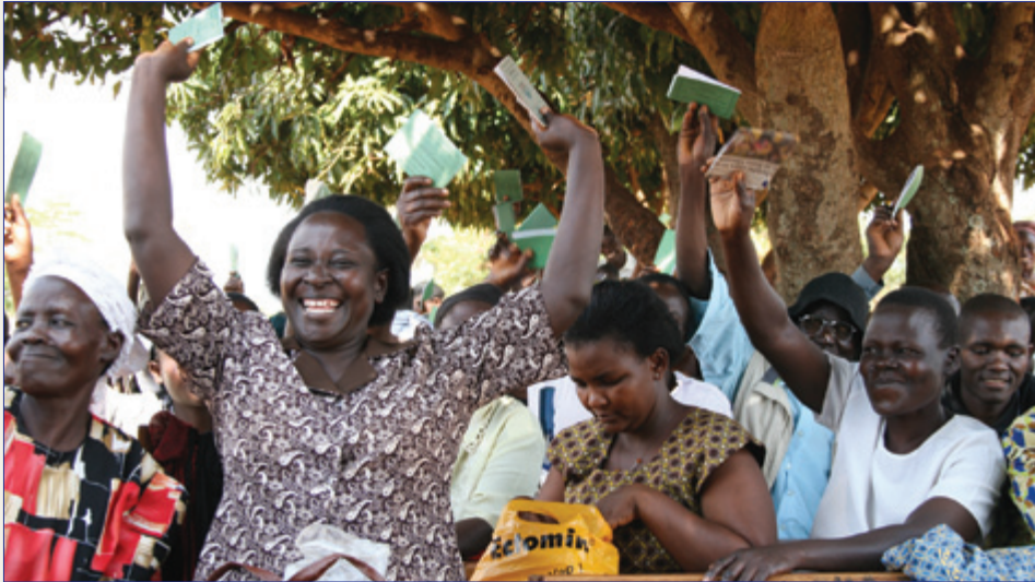
WOMEN INVOLVED IN COL'S LIFELONG LEARNING FOR FARMERS PROGRAMME IN KENYA CELEBRATE OPENING PERSONAL BANK ACCOUNTS

At the end of five years, they [other organisations] washed their hands off, but at COL, they care for you throughout.