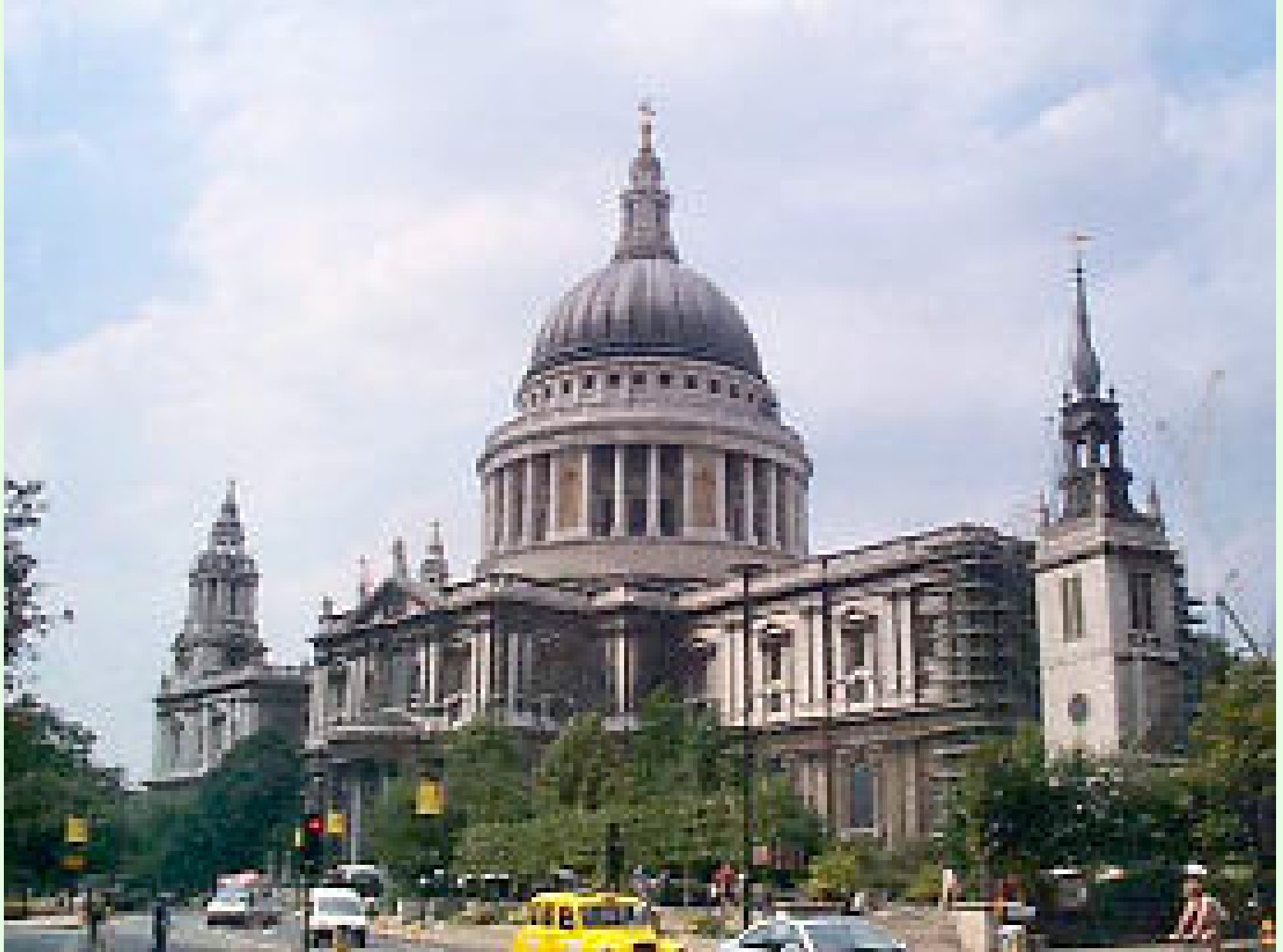
St. Paul's Cathedral, London