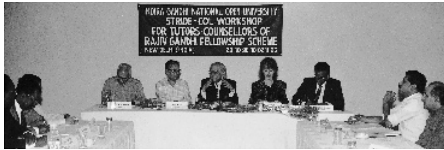
Orientation workshop for tutors assisting with the second year of the Rajiv Gandhi Fellowship Scheme, conducted by the Staff Training and Research Institute of Distance Education at IGNOU in New Delhi.