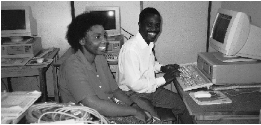
At the National Correspondence College, Luanshya, Zambia